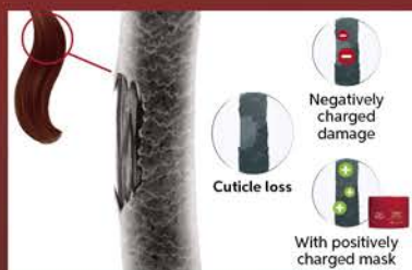
DAMAGE DUE TO HAIR EXTENSIONS