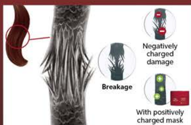
DAMAGE DUE TO HAIR ELASTICS